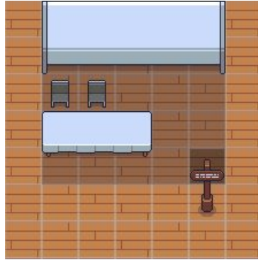
Silver sponsor booth spec