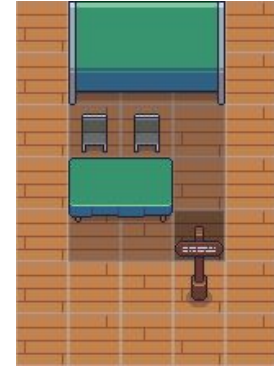
Bronze sponsor booth spec